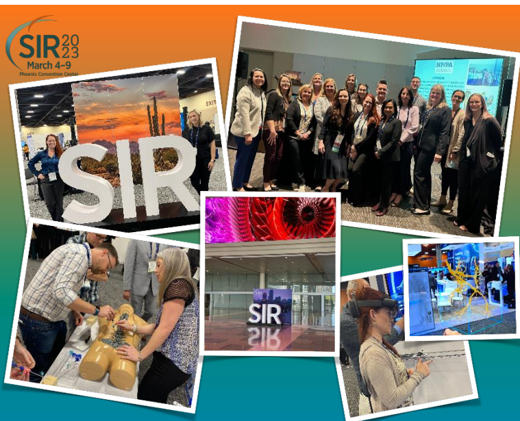
SIR annual meetings