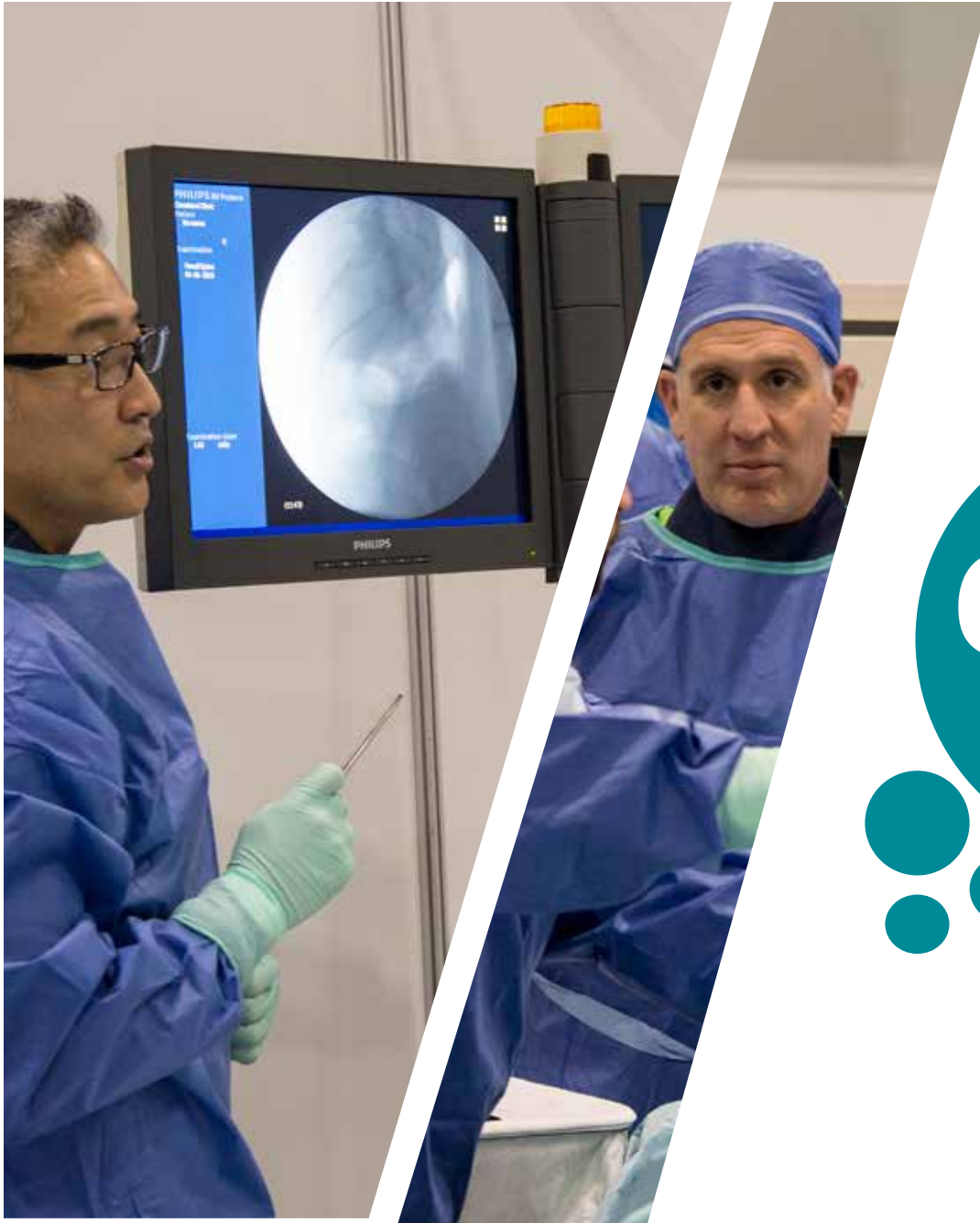
2016 spine lab workshop.