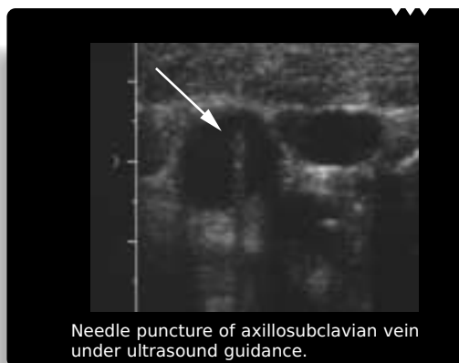
Needle puncture of axillosubclavian vein under ultrasound guidance.

Other advantages include shortened procedure times and decreased costs. Placement in the interventional radiology suite typically requires one-third to one-half the time needed for surgical placement. The schedule in the interventional radiology suite is often more flexible than the operating room schedule, generally allowing same day service for CVAC placement. Placement of CVACs in the interventional suite is typically half the cost of placement by surgical cutdown techniques.