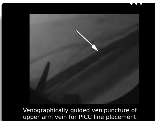
Venographically guided venipuncture of upper arm vein for PICC line placement.